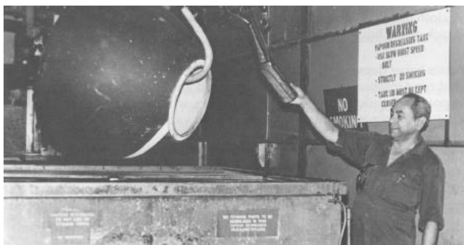
A vapour degreasing tank in operation

Exhaust systems in open-topped degreasing units should be incorporated in accordance with the American Conference of Government Industrial Hygienists' Ventilation Manual. Such ventilation can be in the form of a slot along one or more sides of the tank. Exhaust ventilation will control escape of vapour into the work environment. The discharge should not be recycled into the workplace environment. When degreasers are installed in pits, ventilation should be provided at the lowest part of the pit.